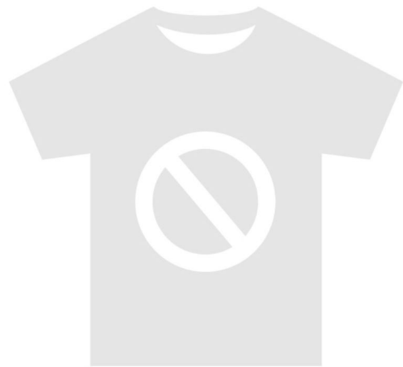
IMAGE NOT AVAILABLE